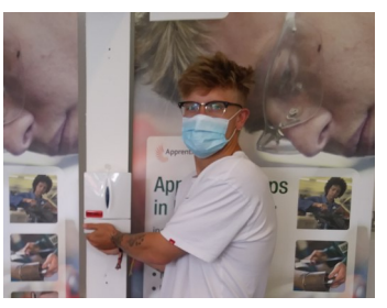
1st year ExxonMobil Apprentice wearing a facemask & using one of the new hand sanitiser dispensers

apprentices, SETA's staff, and other learners can continue their training in a safe environment."